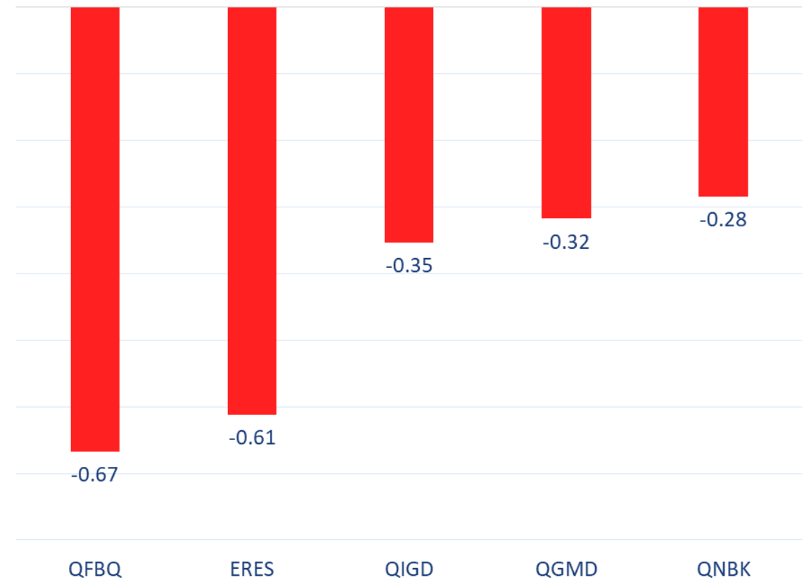
Top 5 Companies sold (net) by Foreigners in the last session