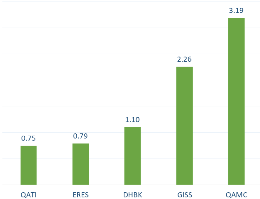
Top 5 Companies bought (net) by Foreigners in the last session