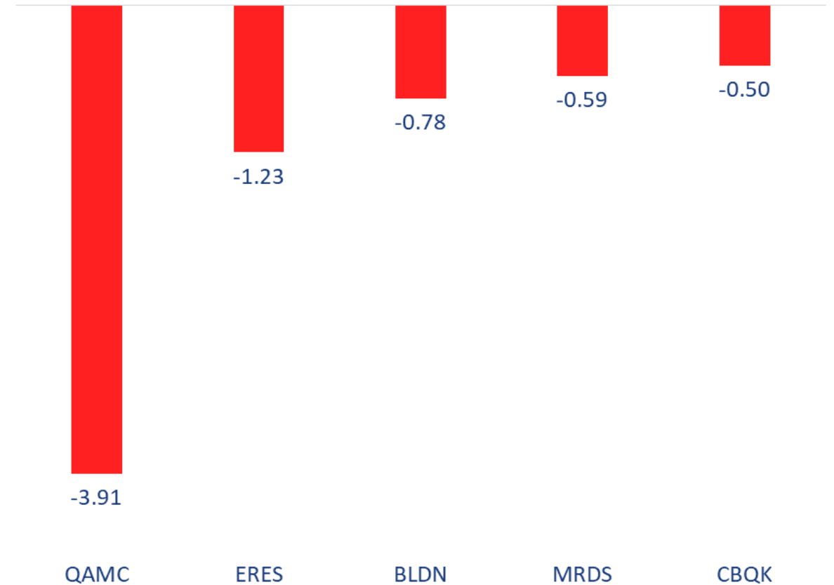
Top 5 Companies sold (net) by Foreigners in the last session