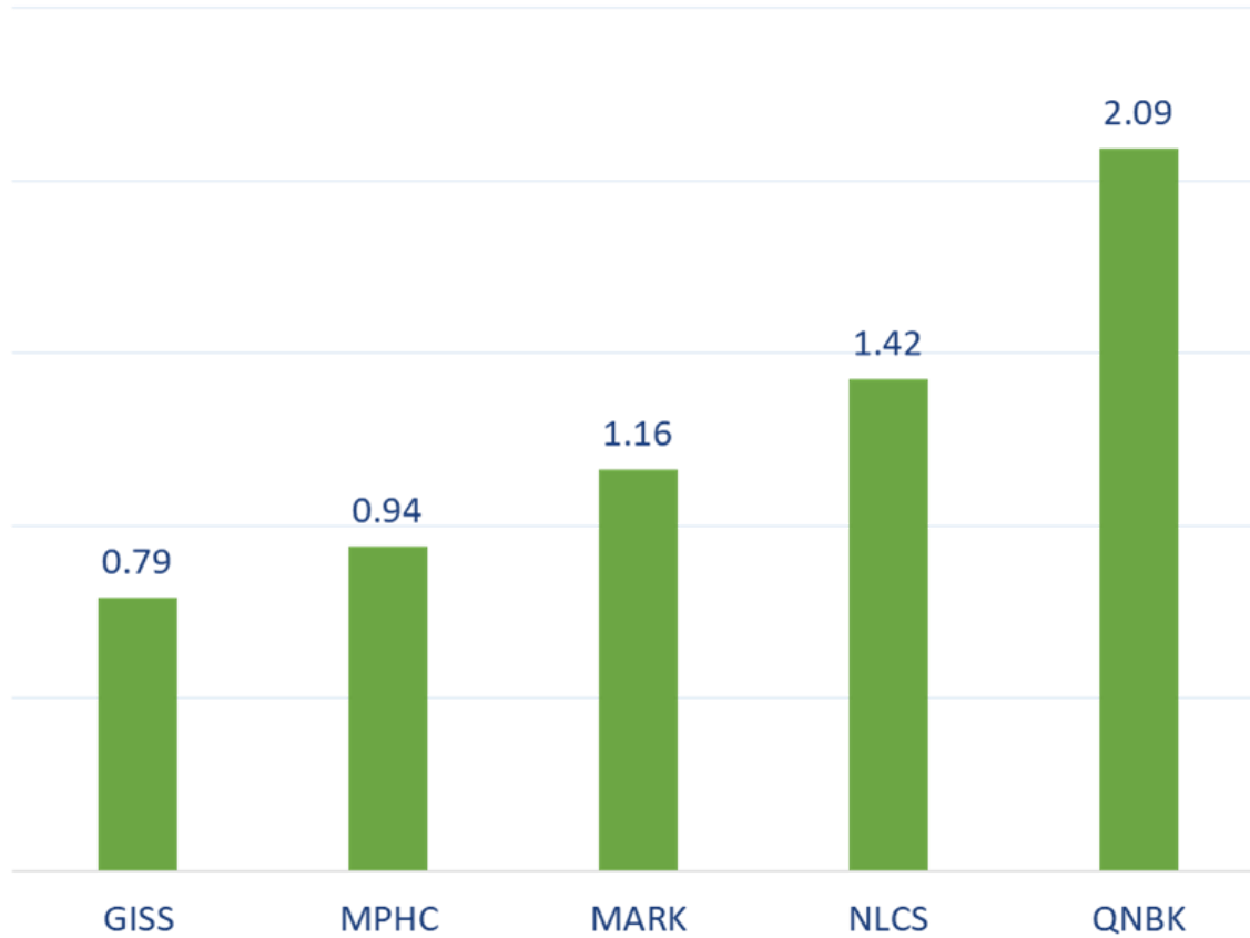
Top 5 Companies bought (net) by Foreigners in the last session