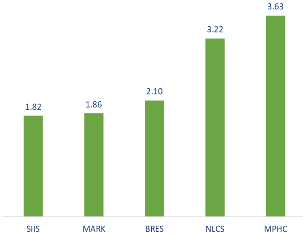
Top 5 Companies bought (net) by Foreigners over the last week