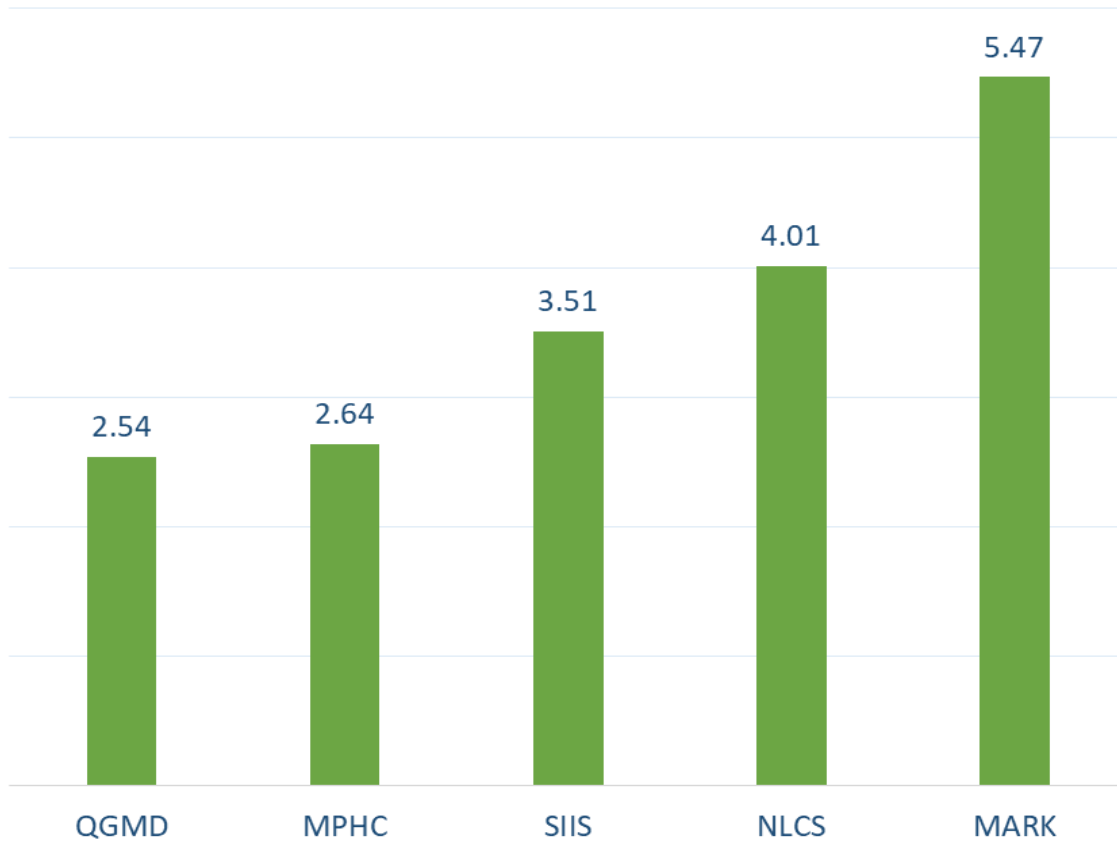
Top 5 Companies bought (net) by Foreigners over the last week