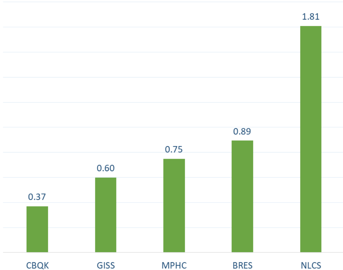
Top 5 Companies bought (net) by Foreigners in the last session