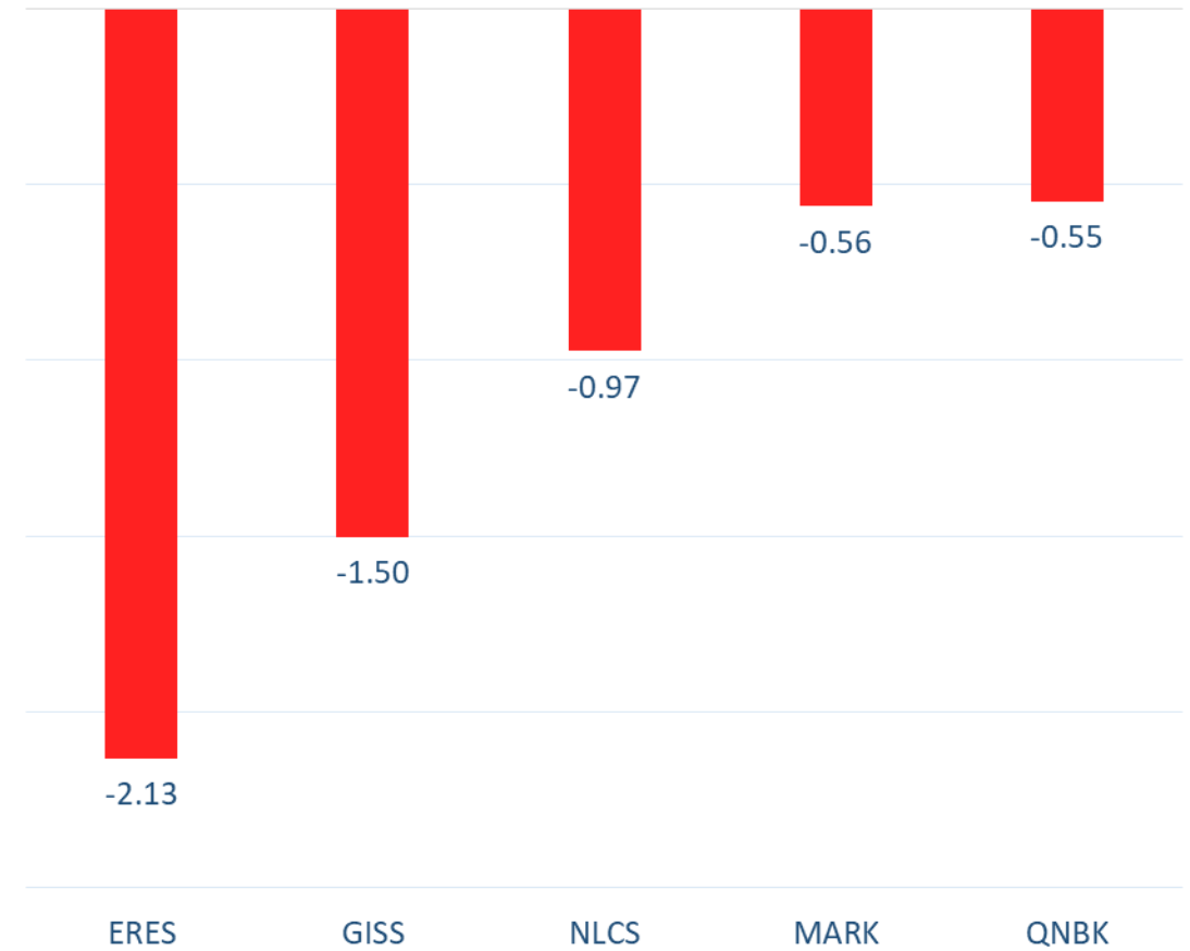
Top 5 Companies sold (net) by Foreigners in the last session